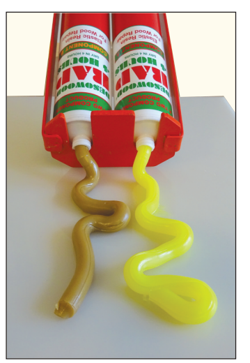
Mix the quantity of DESOWOOD RAP - 4 Hours required

DESOWOOD RAP – 4 HOURS incorporates a mix colour control to ensure that the two components are correctly mixed. Mix until there are no streaks of white.