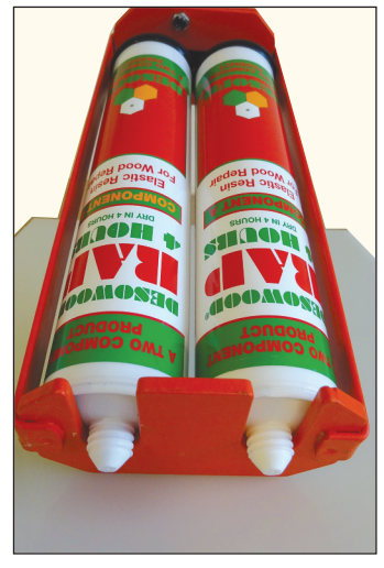
Dispensing DESOWOOD RAP - 4 Hours

DESOWOOD Quick incorporates a mix colour control to ensure that the two components are correctly mixed. Mix until there are no streaks of white.