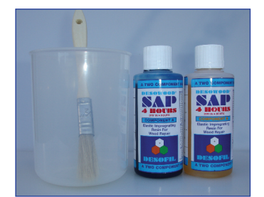
DESOWOOD SAP - 4 Hours, Mixing cup & brush

Remove any surplus DESOWOOD SAP - 4 Hours with a dry brush.