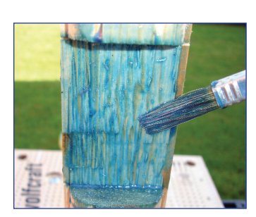
Apply DESOWOOD SAP - 4 Hours liberally