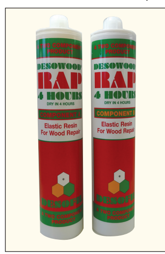
DESOWOOD RAP - 4 Hours

The DESOWOOD RAP – 4 HOURS is dispensed with a purpose designed double barrel dispensing gun for accurate control of composition.